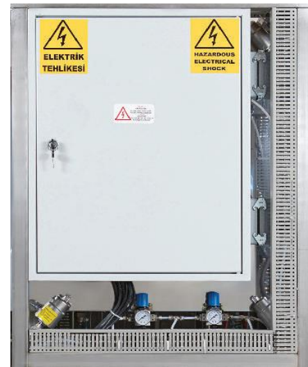
Electric Panel Cover with Electrostatic Painting for Safety

-Chamber, jacket, steam generator and door(s) are made of high quality AISI 316 L / AISI 304 stainless steel while surrounding panels and frame are made of AISI 304 quality stainless steel. Piping and valves are also made of stainless steel in order to increase lifetime of sterilizer. Chamber, jacket and door(s) are insulated with CFC free glass wool while all active pipes have thermal insulation in order to reduce energy loss, making ORSAM steam sterilizers eco-friendly