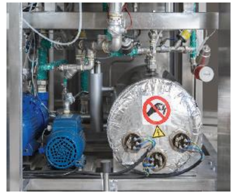
Integrated Steam Generator with Water Supply Pump