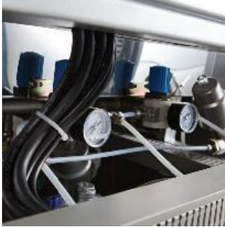
Precise Service with Decent Monitoring at Service Area