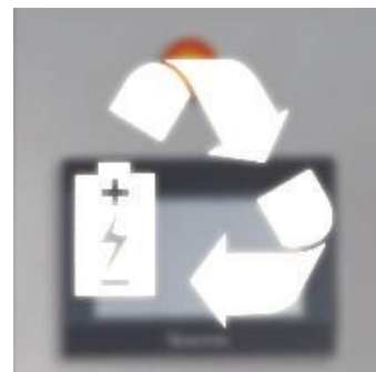
Possibility to Continue Cycle in case of a Power Failure

✉ Kirazlık Mah. 1029.Sk.No:33 Tekkeköy/Samsun/ TURKEY