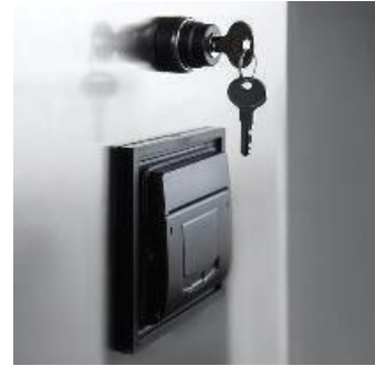
Thermal Printer for Recording and Locking System for Safety