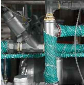
AISI 304 Stainless Steel Piping with Heat Insulation