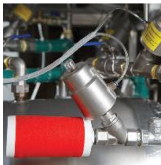
H14 HEPA Filter