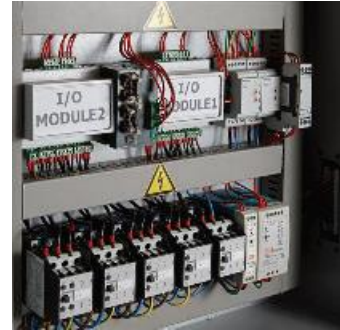
Electric Panel, Designed for Robustness