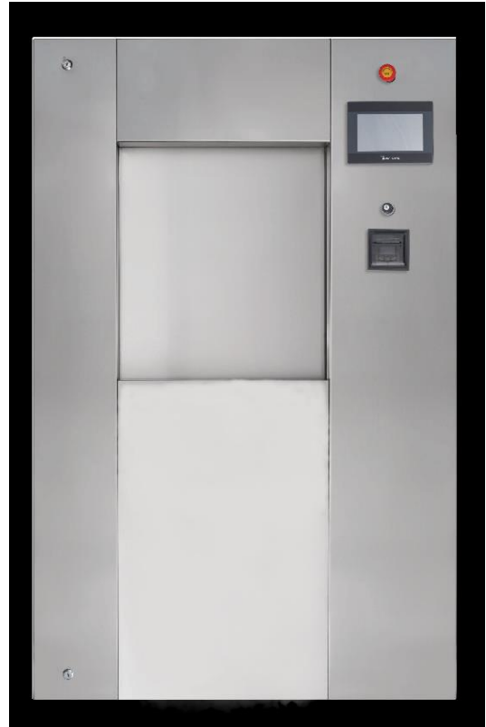
Single or Double Door Formations

7" Color TFT LCD touch screen is standard for pass through models in sterile side with limited functions, in order to enable monitoring and control from both clean and sterile areas.