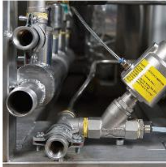
Drain System with Ability to Align Any Side Depending on Site Conditions