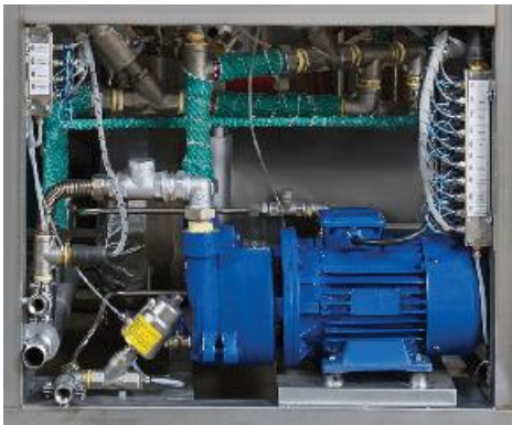
Liquid Ring Vacuum Pump for Fast and Energy Saving Cycles

Optimal & STU compatible design of ORSAM steam sterilizers makes them your partner in daily workflow. We keep in mind your needs for a fast, robust and user-friendly sterilizer while combining it with service engineers' needs for Quality ensured simple & smooth design and administrative unit's all-time efforts for getting all these features within an affordable budget.