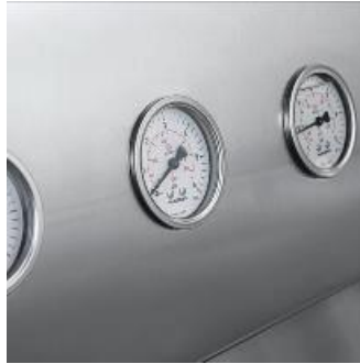
Manometers at Service Area (Standard) or on Panel(s) (Optional)